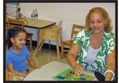
Working with a teacher on a puzzle.