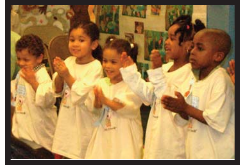
Another graduating class.