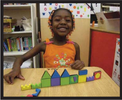
Making a pattern with shapes and blocks.