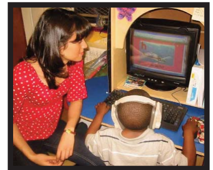
All classrooms have touch-screen computers.