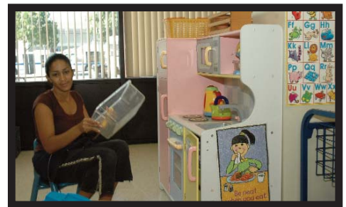
Setting up a Preschool classroom at the East Tremont site in 2008.