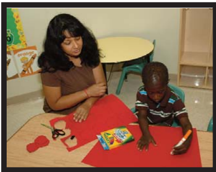
Working hard, without help.