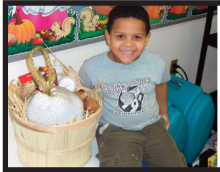
Getting ready to enjoy a Thanksgiving basket.