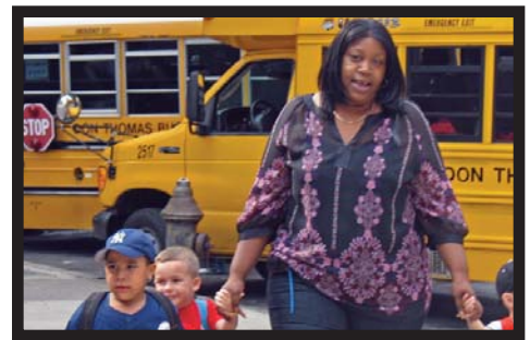
In the morning, children are met at the buses by staff.