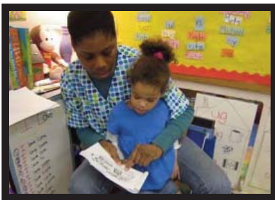
Let's read together.