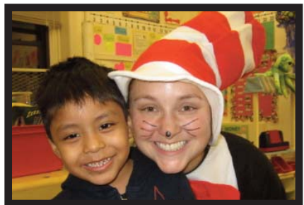
"The Cat in the Hat" is a favorite book.