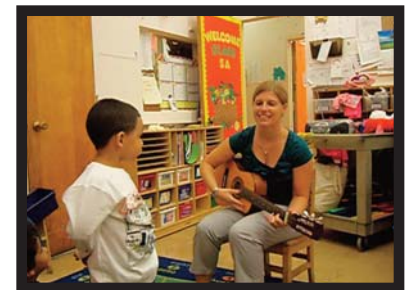
Music therapy class in Manhattan.